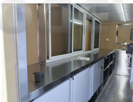
- Interior -