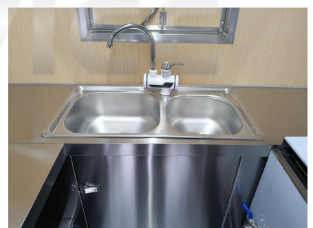
- Sinks -