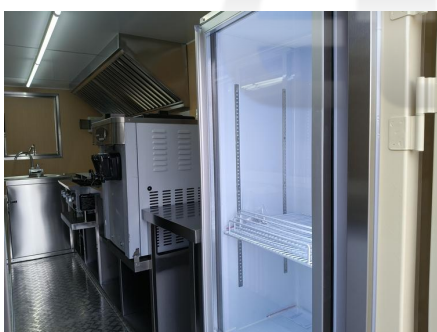
- Interior -